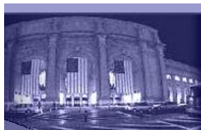
Union Station is a thriving symbol of commerce in Washington, DC and houses several small businesses

The focus of the Conference is to equip business owners and prospective entrepreneurs with the knowledge base to fortify their business structures. By learning to strengthen clientele, diversify products and reach untapped markets, businesses will be able to generate more revenue and achieve greater levels of success. The Conference will be held at the AMC Movie Theater from 8:00 a.m. – 11:00 a.m.